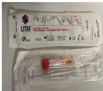
Figure 1. UTM swab